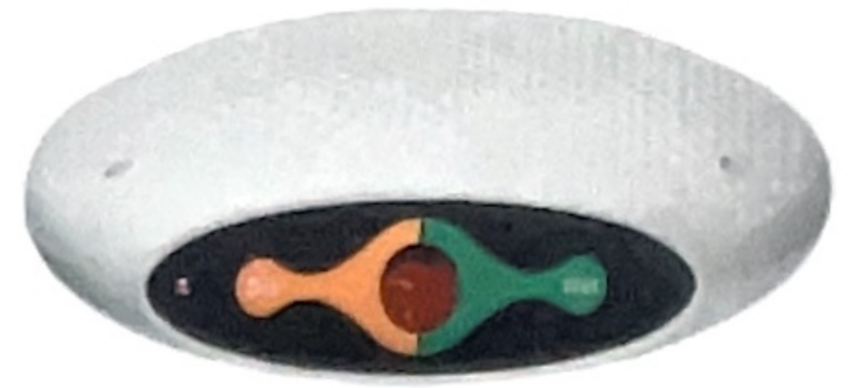
Silica Gel Indicator which tells you when to recharge.

● Orange indicates Dry ● Green indicates Wet