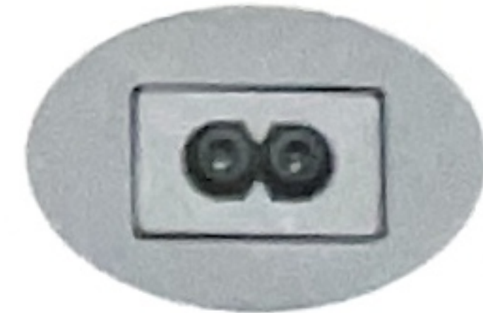
● Mains Plug Connection